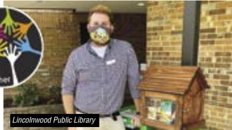
Lincolnwood Public Library