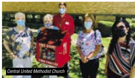
Central United Methodist Church