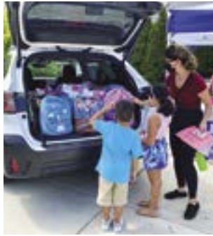
Kids receive new backpacks and school supplies

Niles Township distributed 1,500 backpacks loaded with essential school supplies to students in need before the 2021-22 school year. This compares to 900 backpacks last year, which was already a Township record. Most of the backpacks were distributed in a safe drive-up event. Backpacks for Skokie Morton Grove School District 69 students were handed out on a separate day at the district's schools.