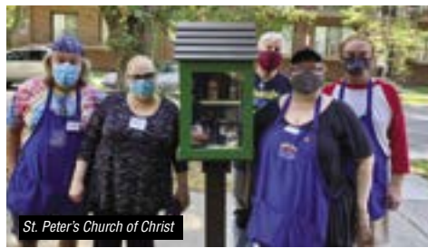
St. Peter's Church of Christ